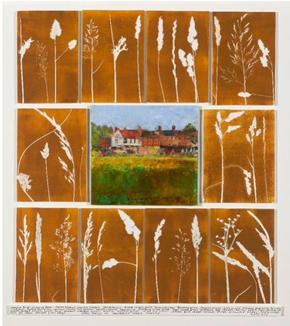
Grasses of Wolvercote Green, Oxford, 2021