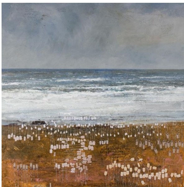
Taxonomy of a Cornish foreshore, 2018