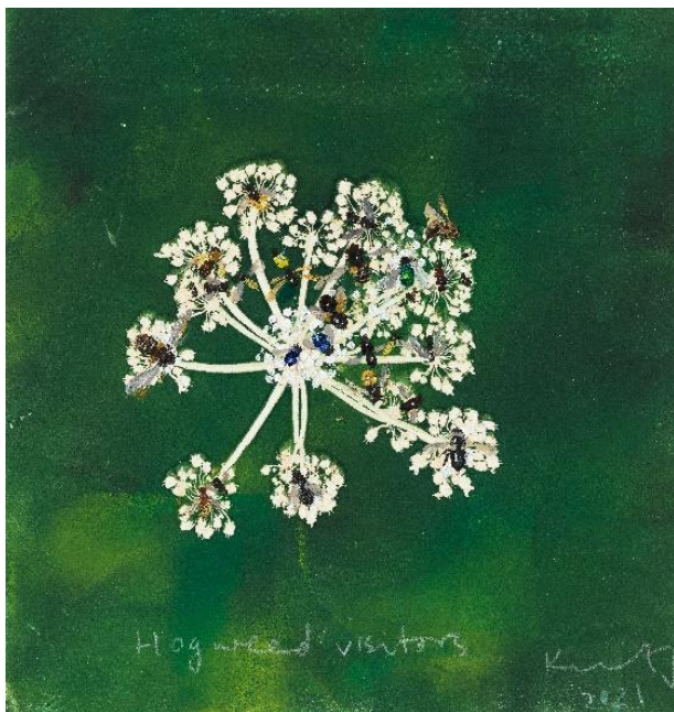
Hogweed visitors, 2021

https://www.dropbox.com/sh/t11md7zuzbu6dhn/AACwH8tDxm4n6kbQkqrqqc1va?dl=0