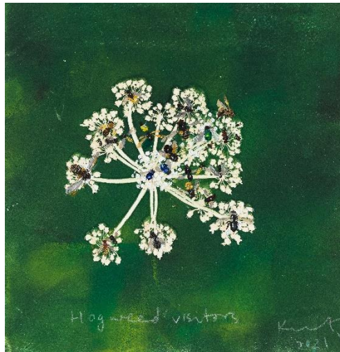
Hogweed visitors, 2021